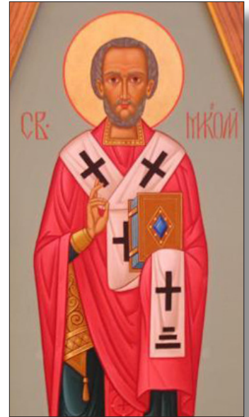
Icon: St. Nicholas Ukrainian Catholic Church, Philadelphia

Raising His eyes toward His disciples the Lord said: "Blessed are you poor, for the Kingdom of God is yours. Blessed are you who are now hungry, for you will be satisfied. Blessed are you who are now weeping. For you will laugh. Blessed are you when people hate you, and when they exclude and insult you, and denounce your name as evil on account of the Son of Man. Rejoice and be glad for your reward will be great in heaven.