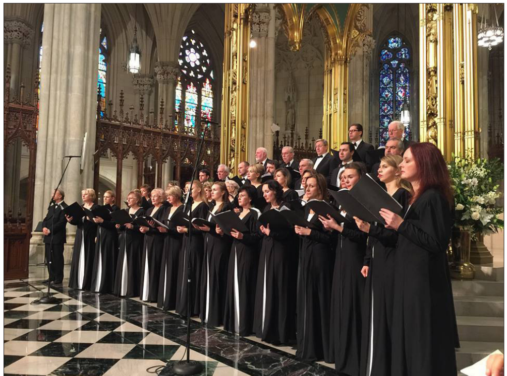
Dumka choir