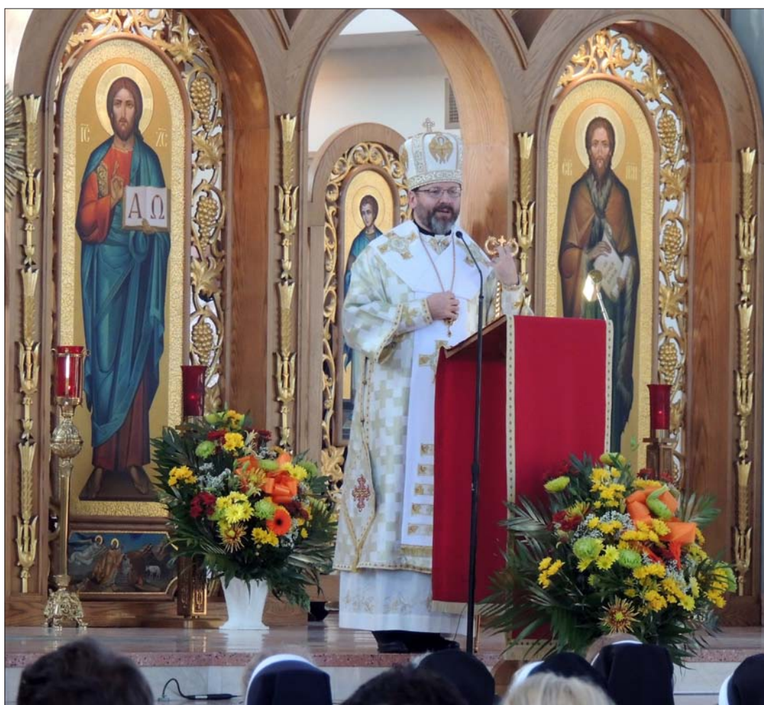
His Beatitude Sviatoslav Shevchuk at the Cathedral in Philadelphia on November 15, 2015

This year, which is also called an Extraordinary Jubilee Year, has been dedicated by the Pope to God's mercy. This is a time of God's special blessings, to undertake a pilgrimage to a Cathedral in our Local or Universal Church. This is a time for healing the wounds of body and soul, a return to God - a rediscovery of Mercy. Standing on the