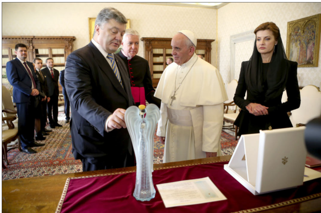
President's visit to the Vatican