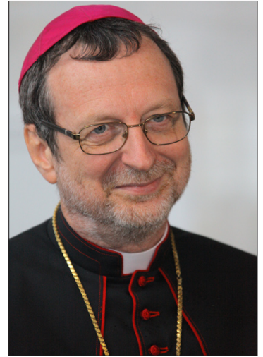
New Apostolic Nuncio in Ukraine