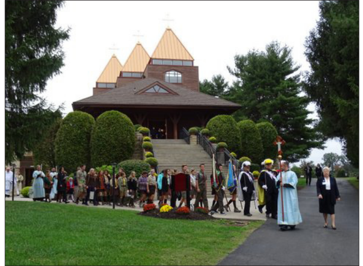
Procession for the Divine Liturgy.