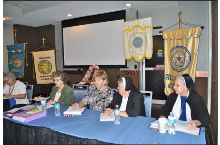
LUC National Board Meeting