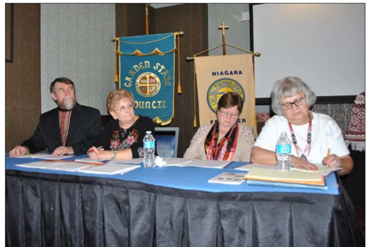
LUC National Board Meeting