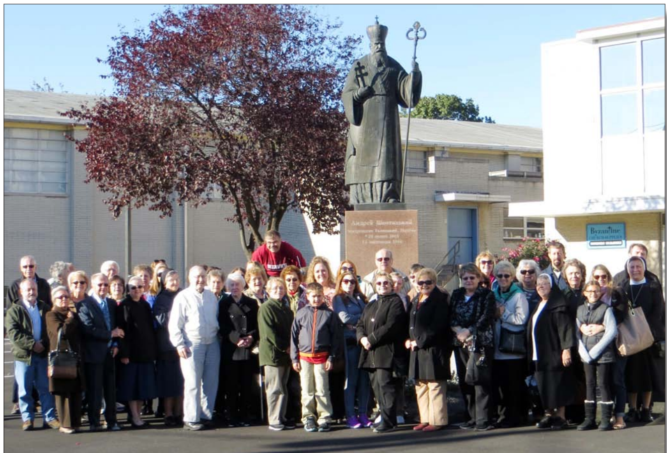
LUC Mobile Workshop participants pose by the statue of Venerable Metropolitan Andrew Sheptytsky on the grounds of the Ukrainian Catholic Cathedral of the Immaculate Conception in Philadelphia on Saturday morning.