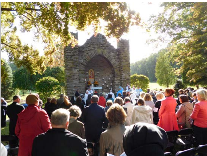
Picture from the Moleben.