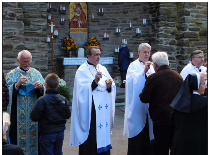
Anointing of the Faithful after the Moleben.