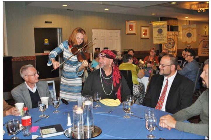
“Gypsy Jazz Night” themed Welcome party on Friday night.