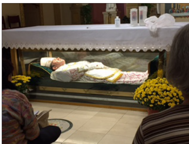
The remains of St. John Neumann at St. Peter the Apostle parish, Philadelphia.