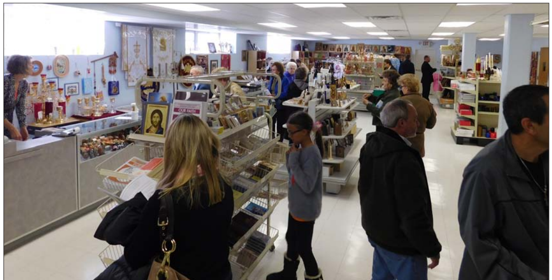
LUC at the Byzantine Church Supplies store on the grounds of the Cathedral in Philadelphia on Saturday morning.

City of Philadelphia; the Jesuit Church of the Gesu. Though no longer functioning as a parish, it is now primarily used only on special