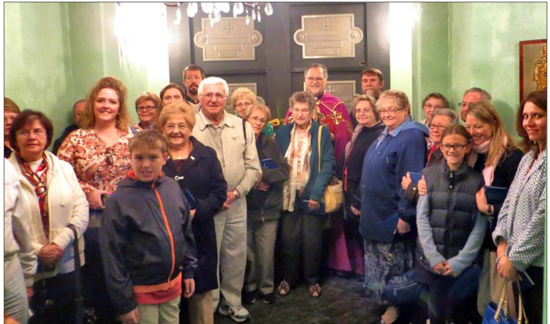
Panachyda at the Crypt in the Ukrainian Catholic Cathedral of the Immaculate Conception in Philadelphia on Saturday morning.

Following an opportunity for shopping at the Byzantine Church Supplies store and a lovely boxed lunch, the group whisked off to the next destination, a masterpiece of baroque Italian architecture and the oldest Roman Catholic Church in the City of Philadelphia; the Jesuit Church of the Gesu. Though no longer functioning as a parish, it is now primarily used only on special occasions by St. Joseph's Preparatory School, a Jesuit high school located on the church grounds. The faculty tour guide provided an astounding history of the controversy, opposition, and even violence that preceded the establishment of