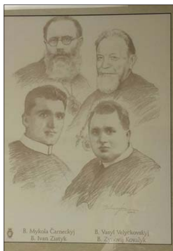
Sketches of Ukrainian Redemptorist Martyrs on display at St. Peter the Apostle parish.