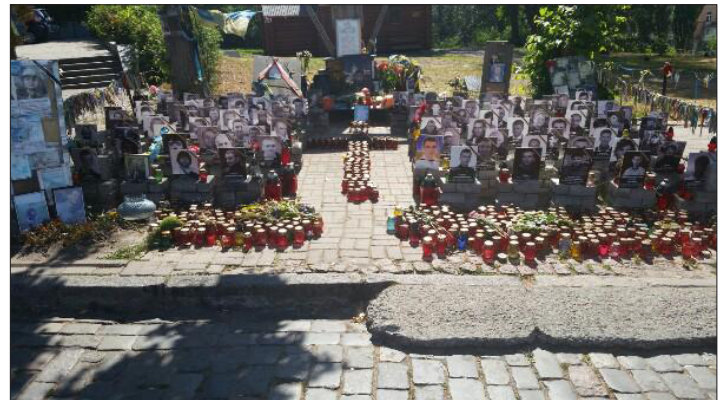
Our USCCB group toured Maidan where "heavenly hundred" died for Ukraine freedom.