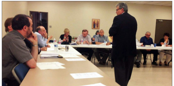
Washington, DC