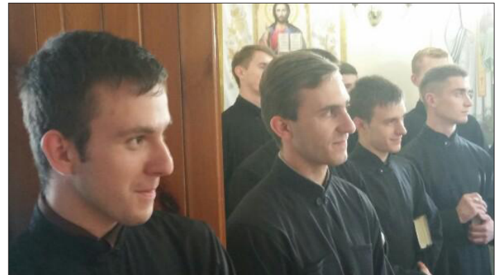
Was inspired by visit to Seminary in Ukraine. Strong faith & full seminary in face of adversity.