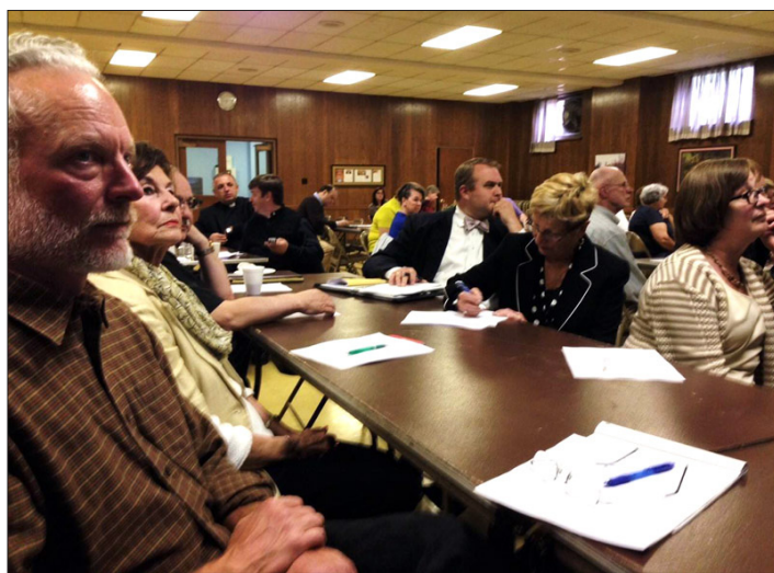
Bethlehem, PA