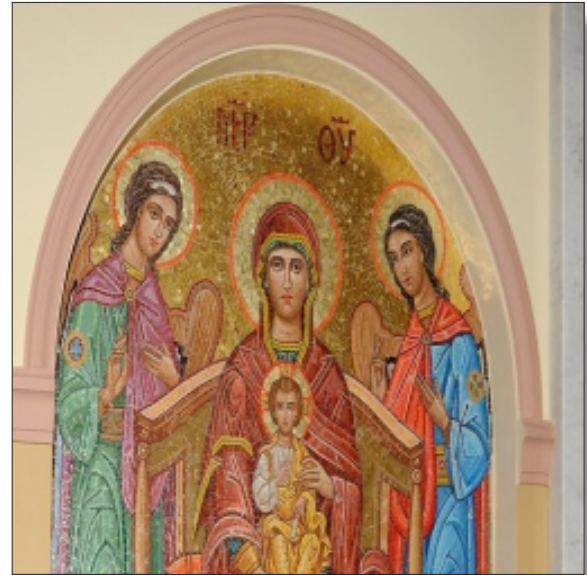
Photo: Theotokos icon at Ukrainian Catholic Church of the Assumption of the Blessed Virgin Mary in Perth Amboy, N.J.

Such reflection on the Theotokos, which means, in Greek, “God-Bearer,” was most appropriate