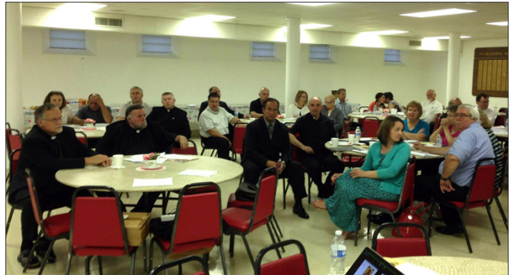
Perth Amboy, NJ