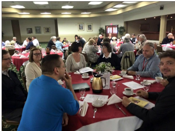
Minersville, PA

The meetings were held on June 2 in Minersville, Pa. for the South Anthracite Deanery, June 3 in Bethlehem, Pa. for the Lehigh-Schuylkill Deanery, June 4 in Philadelphia for the Philadelphia Deanery,