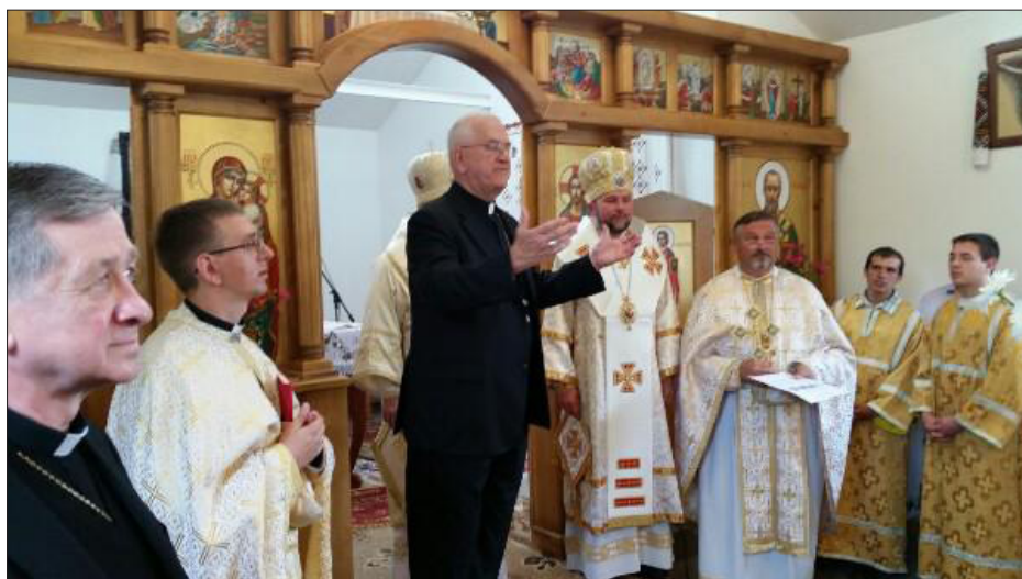
In Kharkiv, Archbishop Kurtz & Archbishop Blase express solidarity to Greek Catholic congregation, Ukraine.

Adapted from an article in Ukrainian on http://news.ugcc.ua/