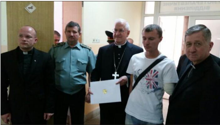
Archbishop Kurtz & Archbishop Blase visit Lviv military hospital in Ukraine. Comfort the injured.