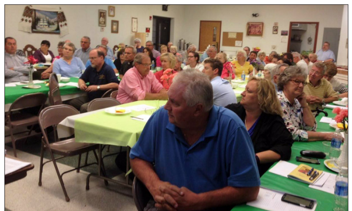
Edwardsville, PA