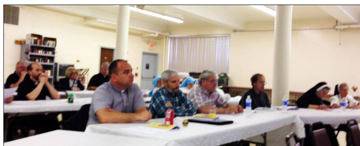
Philadelphia, PA