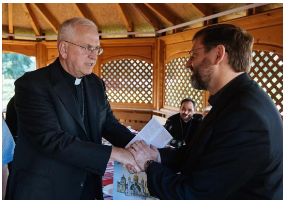
Archbishop Kurtz greets Major-Archbishop Sviatoslav Shevchuk in Ukraine.