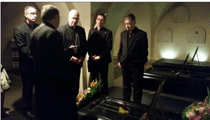
I found today's USCCB visit to crypt of St. George's Cathedral a symbol of suffering Church of Ukraine.