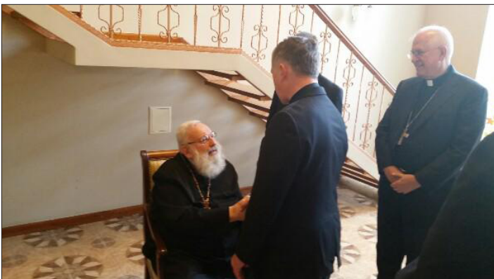
Archbishop Blase & Archbishop Kurtz with Cardinal Lubomyr Husar, spiritual father of Ukraine. Thanked us for solidarity.