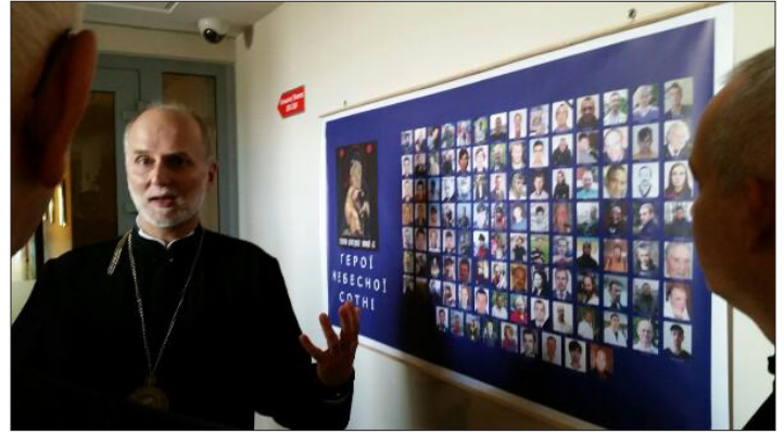
On the USCCB tour of Ukrainian Catholic University, Bishop Borys Gudziak shows poster of "recent martyrs."