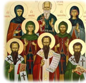
The family of Saint Basil the Great

THE SISTERS OF THE ORDER OF SAINT BASIL THE GREAT FOX CHASE MANOR, PA