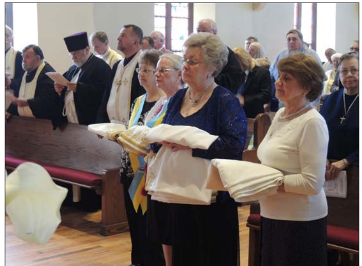
Parishioners carry cloths to be used in vesting the altar.