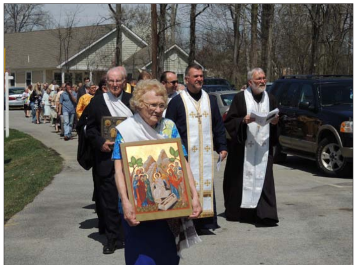
Icon of the Holy Myrr-Bearers