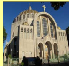
The Golden-Domed Ukrainian Catholic Cathedral of the Immaculate Conception