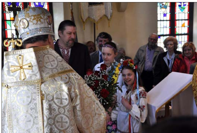
Greeters welcome Metropolitan Stefan with Bread, Salt and Flowers on April 19th.