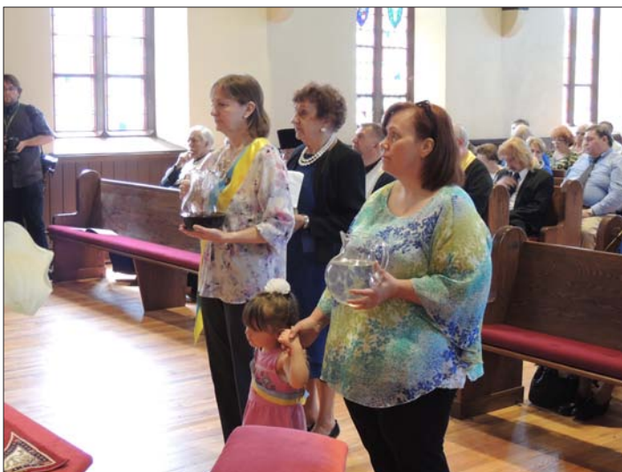
Parishioners carry vessels of liquids to be used in cleansing the altar.