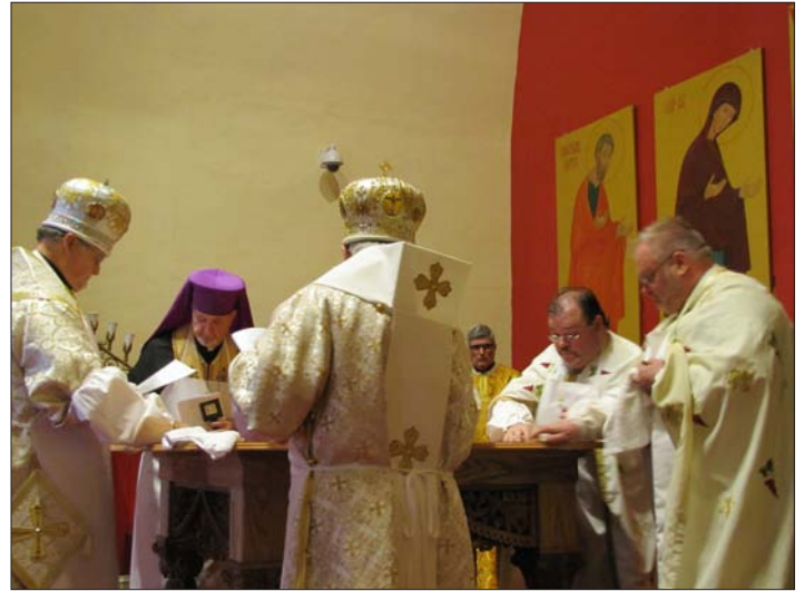
Cleansing altar with soap.