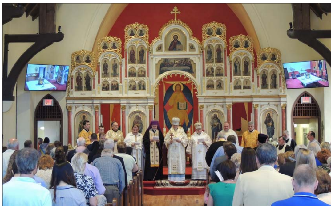
Newly Consecrated Holy Myrrh-Bearers Ukrainian Catholic Church on April 18, 2015.

Ukrainian Catholic Church began at 1pm on Saturday, April 18, 2015 with a small prayer service where the holy relics of three saints: Saint Stephen the Proto-martyr, Saint Dorothea of Caesarea, and Saint