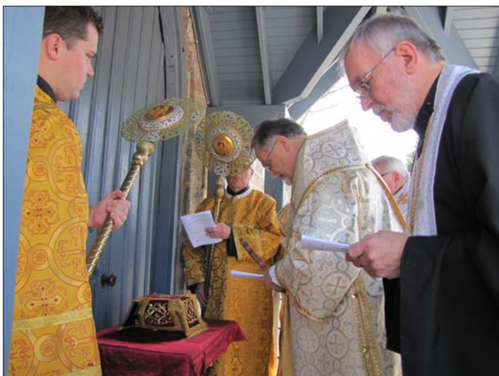
Prayer Service outside of the main entrance of the church.