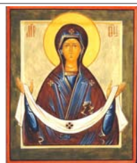
Protection of the Mother of God