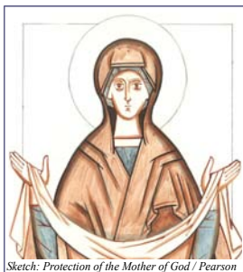
Sketch: Protection of the Mother of God / Pearson

Retreatants will follow step by step instructions to produce an icon of The Protection of the Mother of God. We will also discuss the development of iconography, the spirituality of creating an icon, and praying with icons.