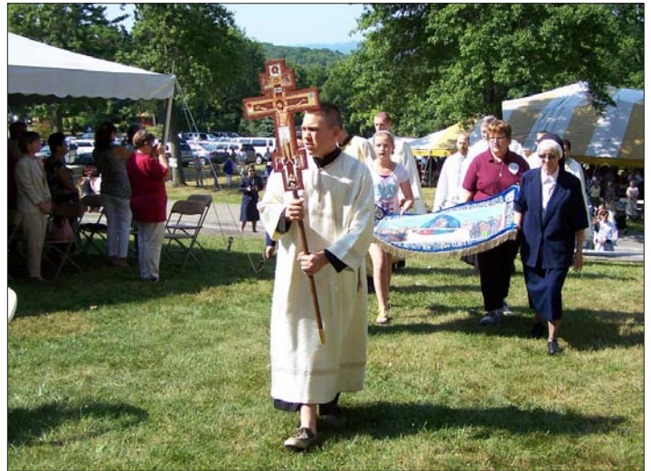
Procession during the Liturgy on Sunday, August 10, 2014.