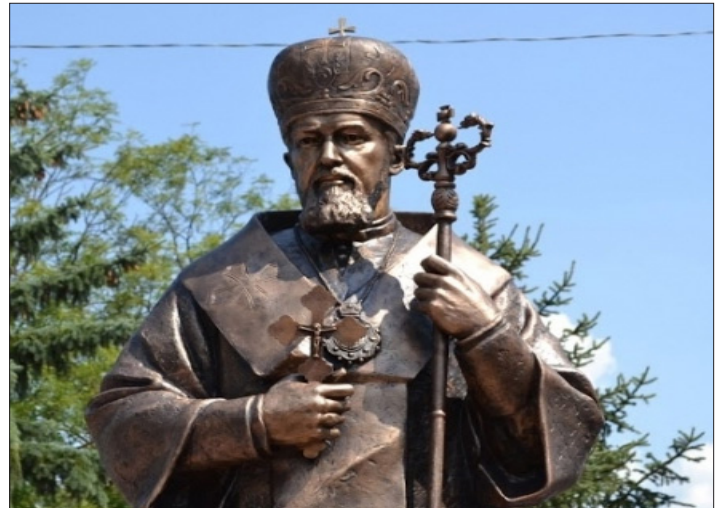
MONUMENT TO CARDINAL LUBACHIVSKY

This was said by the Head and Father, His Beatitude Sviatoslav in the sermon during the Pontifical Divine Liturgy which took place in the UGCC Church of the Nativity of the Blessed Mother of God in Dolyna, in Ivano-Frankivsk region, on August 10, 2014, on the occasion of the hundredth anniversary of the birth of His Beatitude Myroslav Ivan Cardinal Lubachivsky.