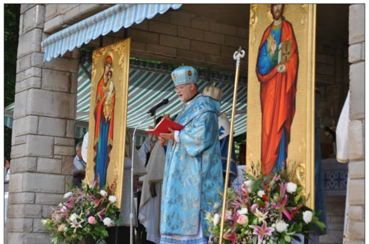
Metropolitan-Archbishop Stefan Soroka