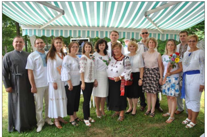
Choir from Passaic, NJ.