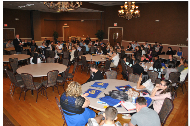
Listening to the keynote speaker.