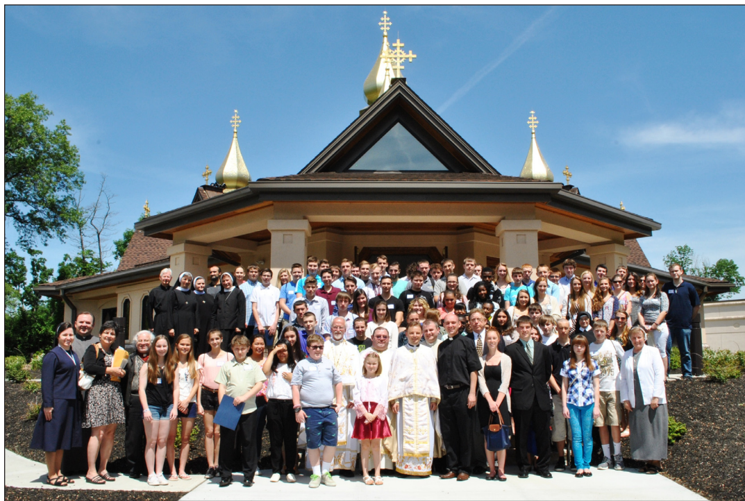
Youth Gathering with the theme "Meeting Christ" in Whippany, NJ

On Sunday, June 1, 2014 the youth of the New Jersey Protopresbyterate (Deanery) gathered at St. John the Baptist Ukrainian Catholic Church, Whippany, NJ for a Youth Gathering with the theme "Meeting Christ". There were about 85 young people, facilitators, clergy, and representatives of the women's religious orders, Missionary Sisters of Mother of God, Sisters Servants of Mary Immaculate, and Sisters of St. Basil the Great in attendance.