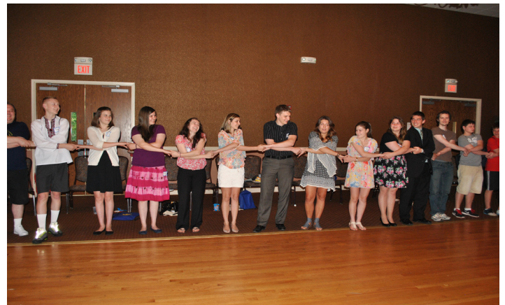
Passing the “spark” to one another.