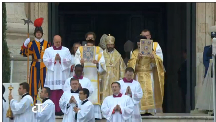
Major-Archbishop Sviatoslav Shevchuk at St. Peter's Square on April 27, 2014.

This morning His Beatitude Sviatoslav, Father and Head of UGCC, participated in the canonizations of two renowned Roman Bishops of the last century: Pope John XXIII and Pope John Paul II. Concelebrants with His Holiness Father Francis were Prelates of various Eastern Churches, 150 Cardinals and over 700 Bishops.