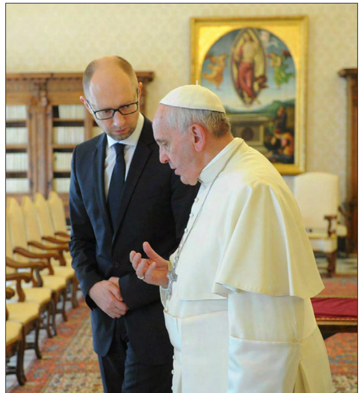
Prime Minister Arseniy Yatsenyuk and Pope Francis.

Adapted from an article on http://risu.org.ua