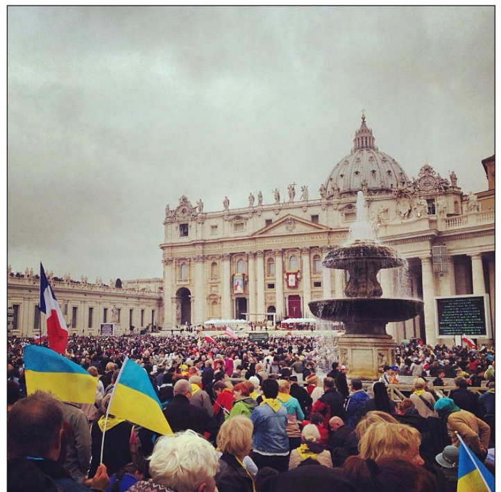
Ukrainian flags are seen in St. Peter's Square on April 27, 2014.

I personally met Pope John Paul II on a number of occasions. Especially I recall a lunch at his residence with eight other Eastern Catholic Bishops during the Special Synod on the theme of Bishops. Pope John Paul II showed such intense interest in the affairs of each of the Eastern Catholic Churches, and ensured that each of us were fully involved in the discussion, to the extent of even limiting one bishop who wanted to monopolize the discussion. Pope John Paul II looked upon people as individuals even amidst crowds. He expressed this saintly quality as did Blessed Mother Teresa of Calcutta whom he knew well. His unconditional service of the Lord and of His