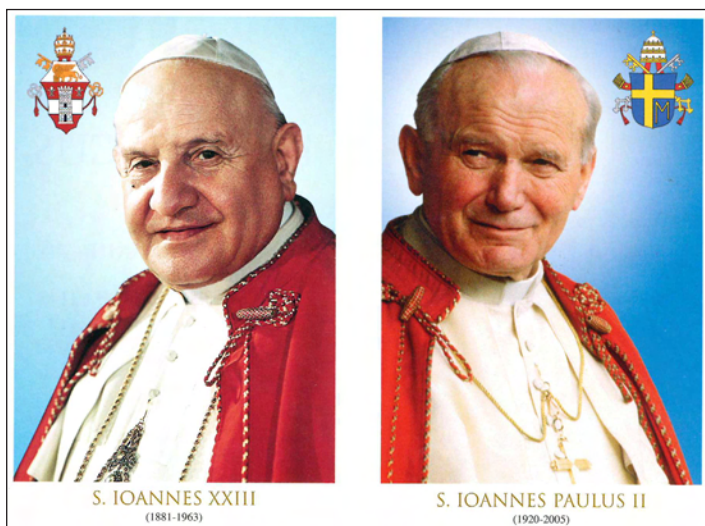
Saint John XXIII and Saint John Paul II

The Pontifical Mass and canonization ceremonies celebrated by the Holy Father, Pope Francis on Sunday, April 27, 2014, began with great solemnity but under dark clouds and with light rain falling. At the moment Pope Francis prayed the Prayer of Canonization, "For the honour of the Blessed Trinity, the exaltation of the Catholic faith and the increase of the Christian life, by the authority of our Lord Jesus Christ, and of the Holy Apostles Peter and Paul, and our own, after due deliberation and frequent