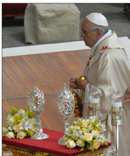
Pope Francis and the relics.