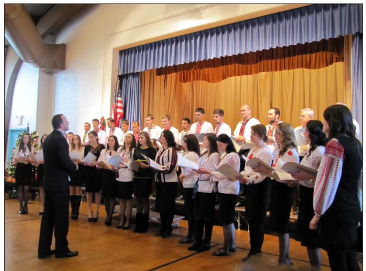
Youth Choir: Ukrainian Baptist Church Philadelphia, PA