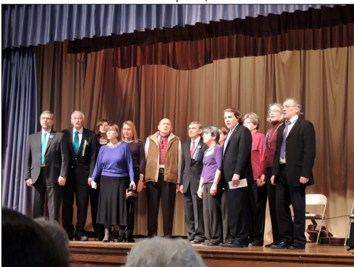
Choir "Living- SONG" Washington, DC