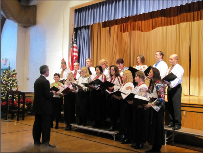
Chamber Choir "Accolade" Philadelphia, PA