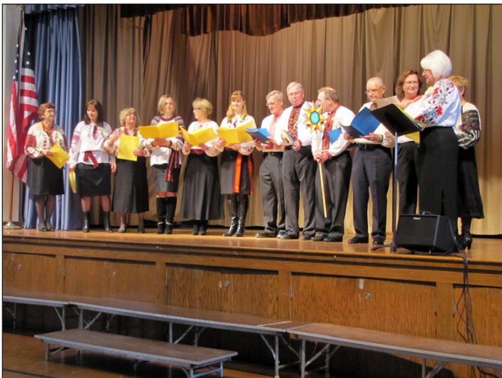
Choir: Saints Peter and Paul parish Phoenixville, PA