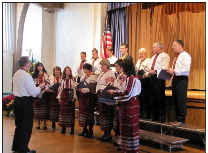
Choir: St. Josaphat parish Trenton, NJ

Watch videos from the Festival on our YouTube Channel at http://www.youtube.com/user/thewayukrainian