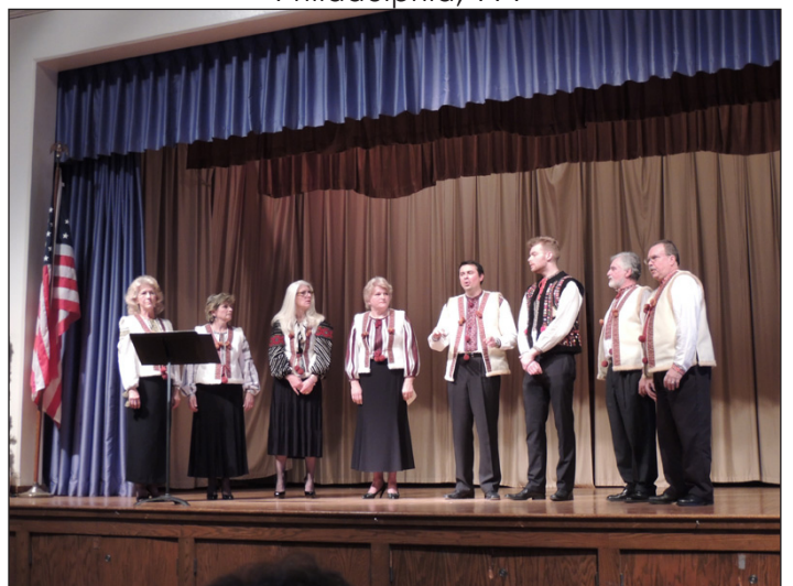
Assemble "First Class" Baltimore, MD