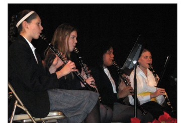
Clarinets of Jazz Band