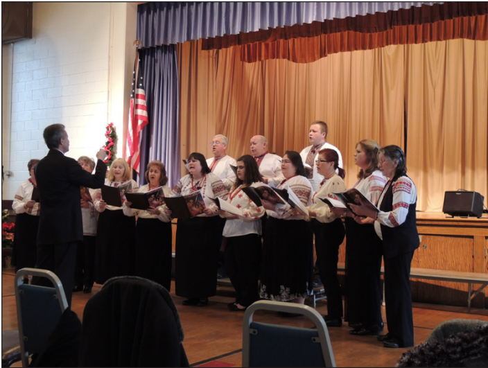
Combined Choir: Cathedral Choir of the Immaculate Conception & St. Josaphat, Philadelphia, PA