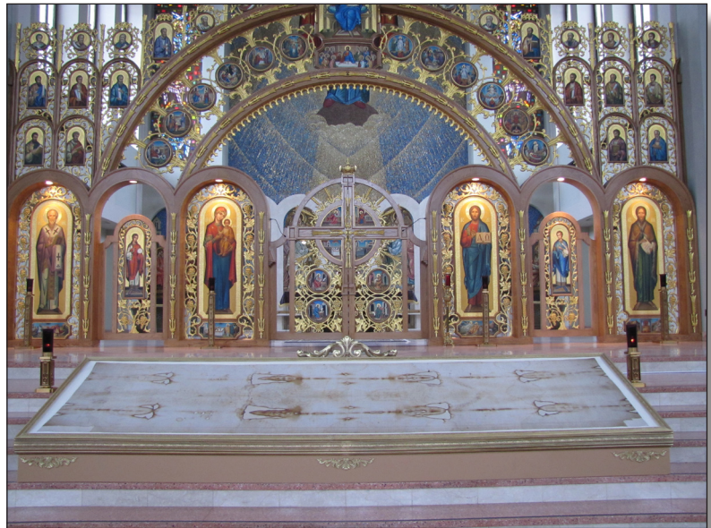
Photo: Replica of the Shroud of Turin on display at the Cathedral in 2010

Any parish in the Archeparchy interested in hosting the Shroud should contact the Chancery's Evangelization office. The Shroud Exhibit offers a perfect opportunity to engage your parish community in opening it's doors to your local community. The Exhibit gives our people a chance to share their faith and their church with their neighbors. It presents a forum through which your services, your hospitality, and your faith can invite people to come to know Jesus through this endeavor.