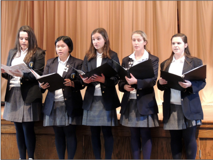
Choir: St. Basil Academy Jenkintown, PA