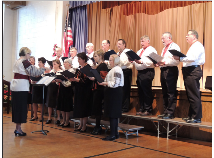
Choir: Annunciation of the Blessed Virgin Mary, Melrose Park, PA