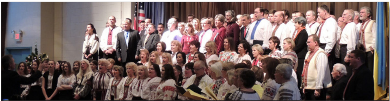
Combined Choir Finale