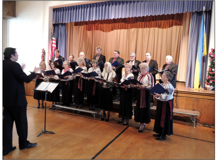
Choir: St. Michael parish Baltimore, MD