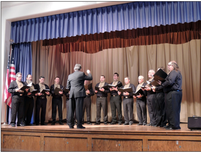
Male Choir: "Dzvin" Philadelphia, PA