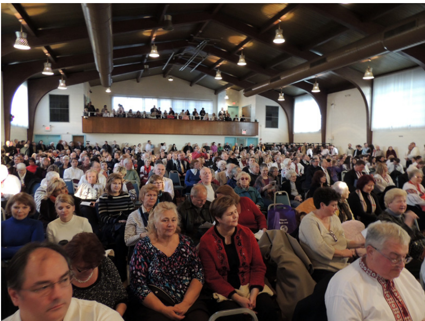
The Audience at the Cathedral Hall