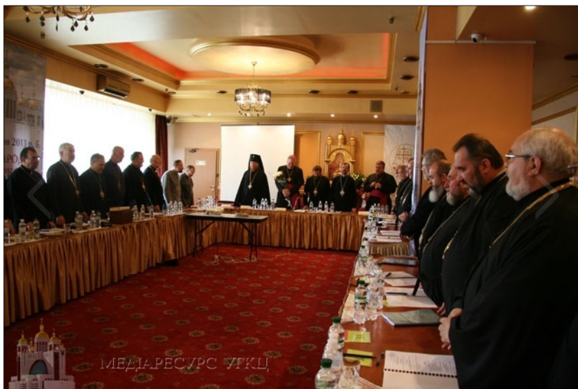
Picture from the Synod.

In discussing the issue of why our society needs missionary work, a new evangelization, His Beatitude told the nuns that the Ukrainian society needs a Church today which would be active in social services. "This is a colossal effort in which one can carry into society Christ's Gospel. When we perform some act of mercy, we do not question whether the receiver is a believer or not, whether s/he is Orthodox, or some other confession. We serve everyone. And on the basis of such sincere service one can overcome certain prejudices and discover the real Christ," argues the Primate.