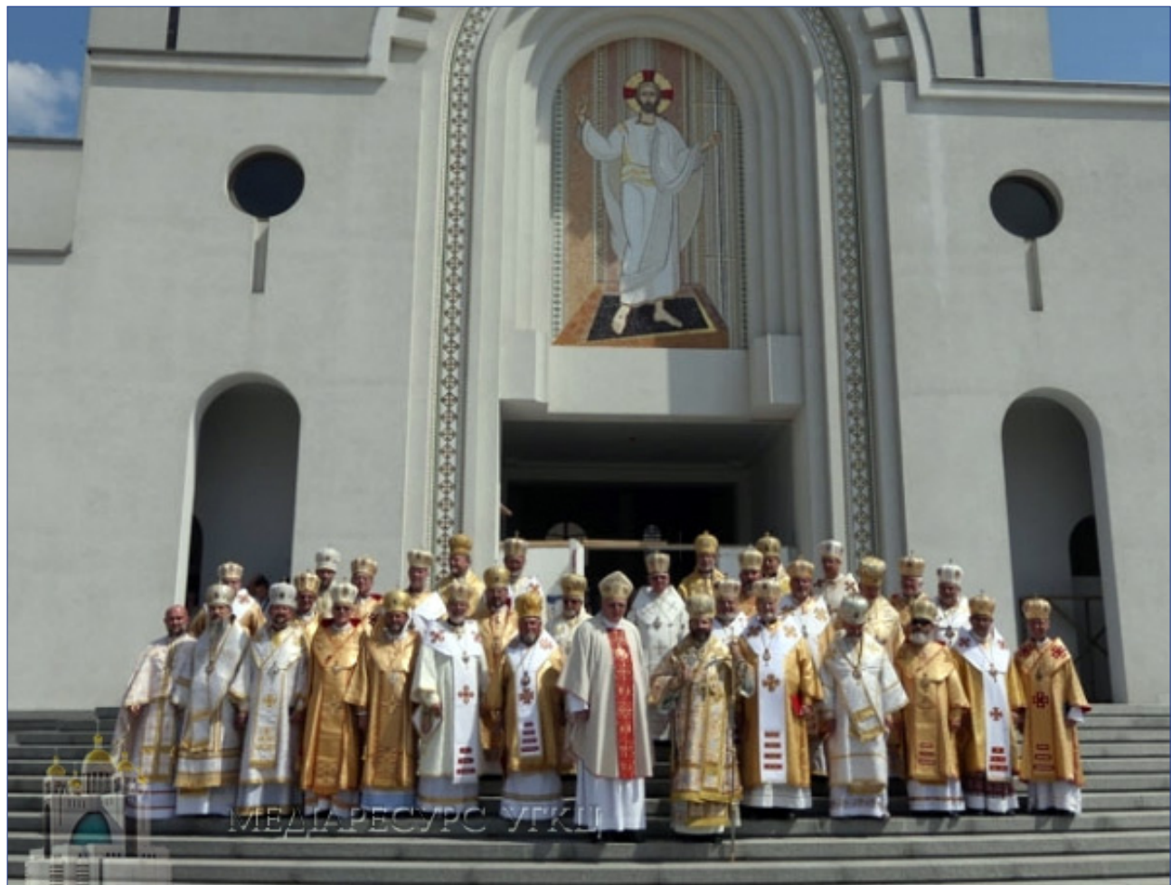
Patriarchal Cathedral of the Resurrection of Christ.