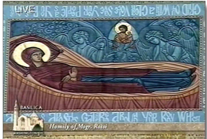
This photo of the Dormition Icon was taken while watching the EWTN broadcast of the homily on TV.

This year's celebration of the Assumption marked the 100th anniversary of the granting of permission by Pope Pius X for the construction of the National Shrine. On August 15, 1913, Pope Pius X in an audience gave this permission to Cardinal James Gibbons, Archbishop of Baltimore, who was accompanied