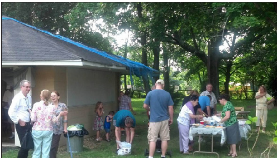
All hands pitching in to clean up after the potluck. Even the children present had a good time helping out!