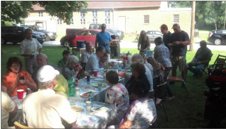
Parishioners and family members relax under the shade of Sts. Peter and Paul Picnic Grove.