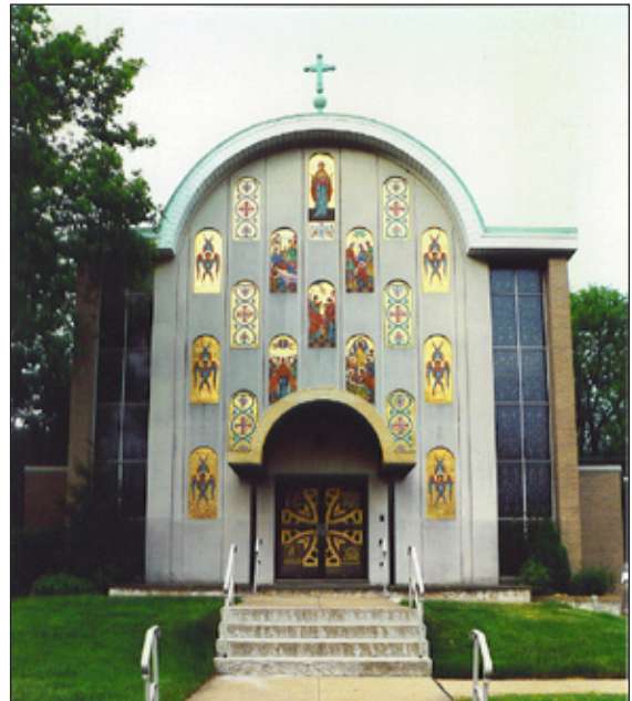
Immaculate Conception Ukrainian Catholic Church, located at the intersection of Liberty Ave & Bloy St, Hillside, NJ was incorporated in 1957.