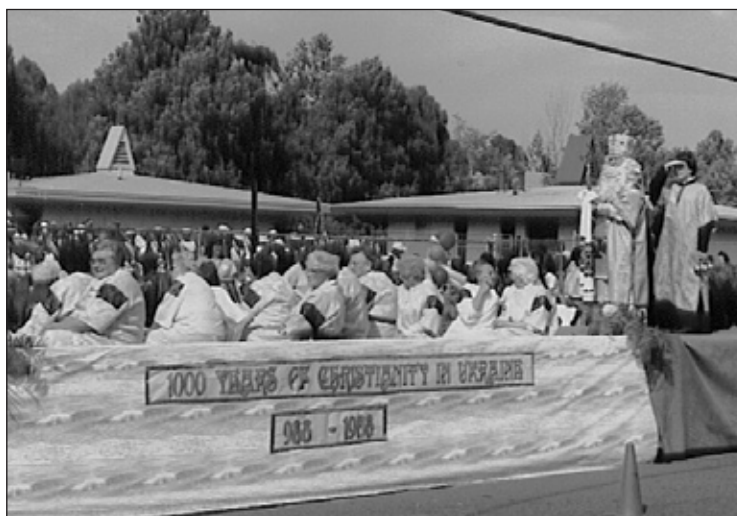
In 1988, a parade float celebrating 1000 years of Christianity in Ukraine passes the Hillside Township Pool. The same year marked the Township of Hillside's 75th Anniversary.