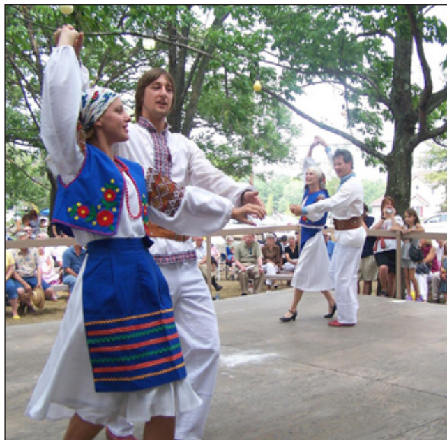
Kazka Dance Ensemble

Since 1987, the group has performed throughout the eastern United States and beyond. The group performed at Walt Disney World in Orlando Florida in January of 2004. In 1992, the ensemble traveled and performed in the newly independent nation of Ukraine as part of a tour benefiting the Children of Chernobyl Fund. Kazka has appeared on the nationally televised program "The Wedding Story," produced for The Learning Channel and locally on WVIA, public television. The group has also graced the stages at Bethlehem Musikfest, Ellis Island National Park, Soyuzivka Ukrainian National Resort and the Pennsylvania State University Slavic Festival.