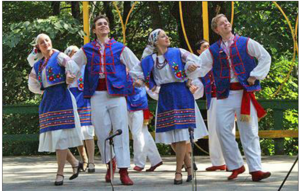
Kazka Dance Ensemble

Home-made Ukrainian and Slavic foods, including holubtsi-halupki, halushki, pyrohy, kobasa-kielbasi, bleepies, sausage, Lemko platters,