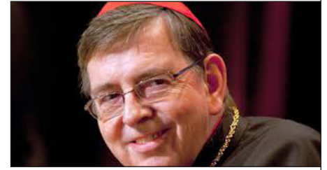
Cardinal Kurt Koch

Cardinal Kurt Koch, the president of the Pontifical Council for Promoting Christian Unity, noted that in recent times the number of accusations of proselytism against Greek Catholics in western Ukraine from the Orthodox has significantly decreased.