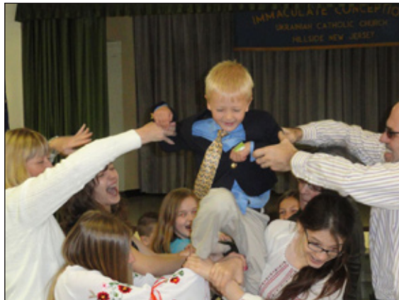
Children of Immaculate Conception Ukrainian Catholic Church perform Hahilky (ancient Ukrainian spring ritual dances and songs) in celebration of Easter.