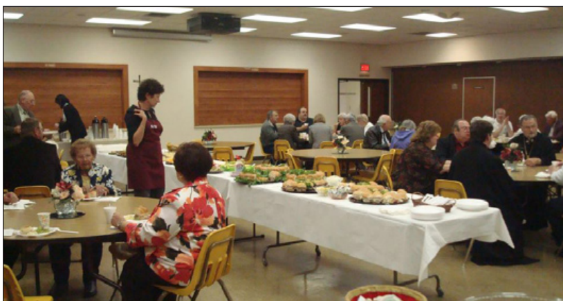
Social after the Liturgy