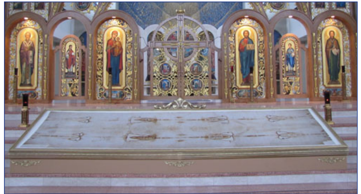
Replica of the Shroud of Turin displayed at the Cathedral in Philadelphia.

The actual shroud is a 14-foot long, 3 1/2-foot wide linen cloth bearing the front and back image of a scourged, crucified man, according