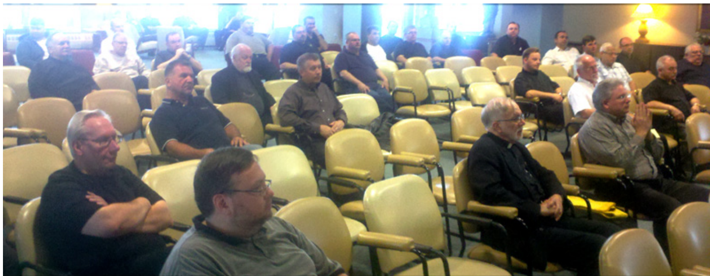
Clergy listen during one of the spiritual conference sessions.