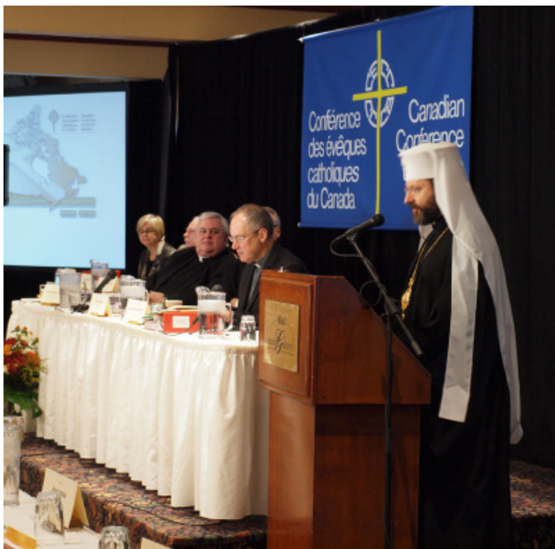
His Beatitude Sviatoslav addressing the members of the Canadian Conference of Catholic Bishops at their Plenary session.

This is the year of Canada, Shevchuk said. It is the 100th anniversary of the appointment of the first Ukrainian Catholic Bishop to Canada in the person of Blessed Martyr Nykyta Budka. This year the Synod of Ukrainian Catholic Greek Catholic Bishops held their annual meeting in Canada. He also reminded the bishops that in April of this year he was in Ottawa with members from the Ukrainian Council of Churches when the members of parliament in the Canadian House of Commons approved a declaration acknowledging “the heroic virtues” of his predecessor the great archbishop of Lviv, Metropolitan Andriy Sheptytsky for his role in saving hundreds of Jewish children during the Nazi occupation of Western Ukraine.