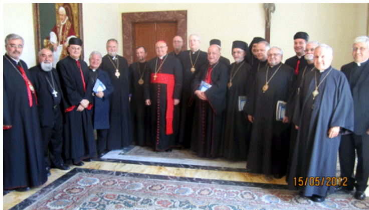
Following the liturgy in St. Peter's Basilica the bishops paid a visit to the Vatican Congregation for the Eastern Churches and met with its Prefect, Cardinal Leonardo Sandri. In the above photo the bishops stand with the Cardinal and the Secretary of the Eastern Congregation, Archbishop Cyril Vasil. http://www.stamforddio.org/

A visit with the Supreme Tribunal of the Apostolic Signatura began the proceedings for Wednesday, May 16 th . A review of the eparchy's canonical cases and