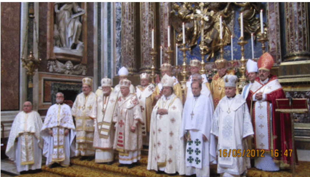
In the above photo the concelebrating bishops and priests pose in front of the altar at the conclusion of the Divine Liturgy. http://www.stamforddio.org/

Нехай Господь щедро благословляє вас лише Йому відомими шляхами! +Христос Воскрес!