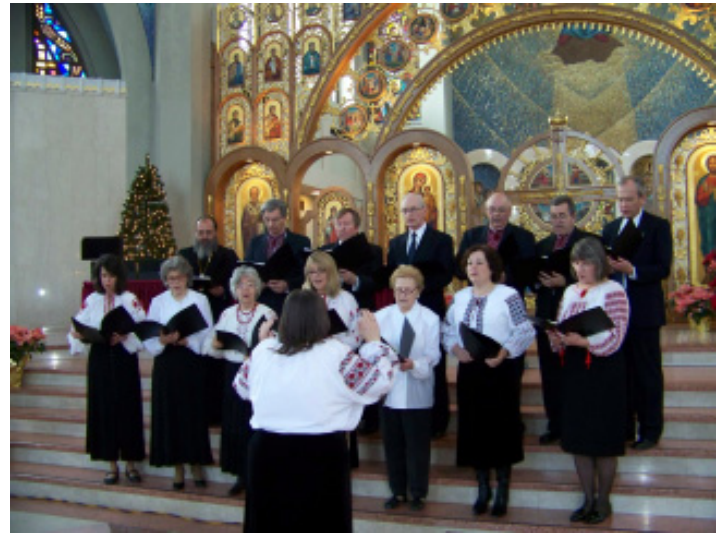
Alexander Koshetz Choir of St. Volodymyr's Ukrainian Orthodox Cathedral, Philadelphia, PA