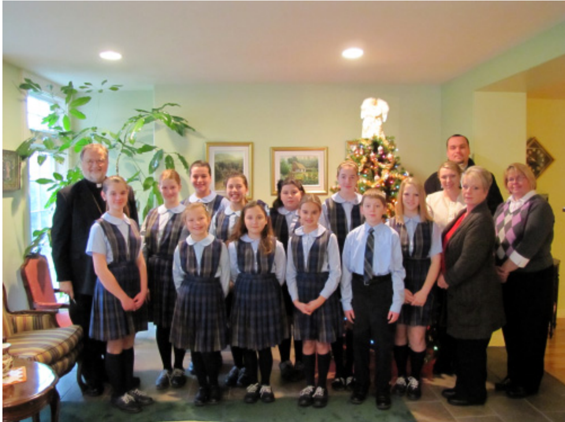
St. Josaphat Ukrainian Catholic School, Philadelphia, PA (December 20, 2011)