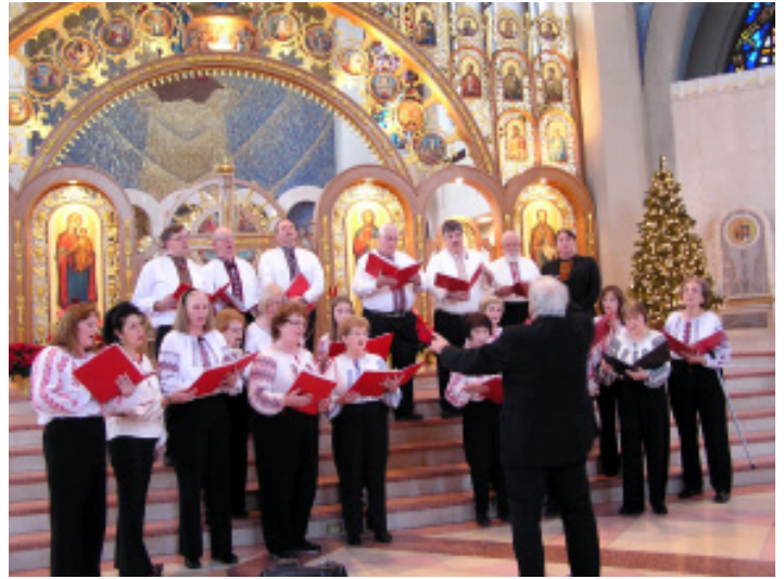
Choir from Ss. Cyril and Methodius parish, Olyphant, PA