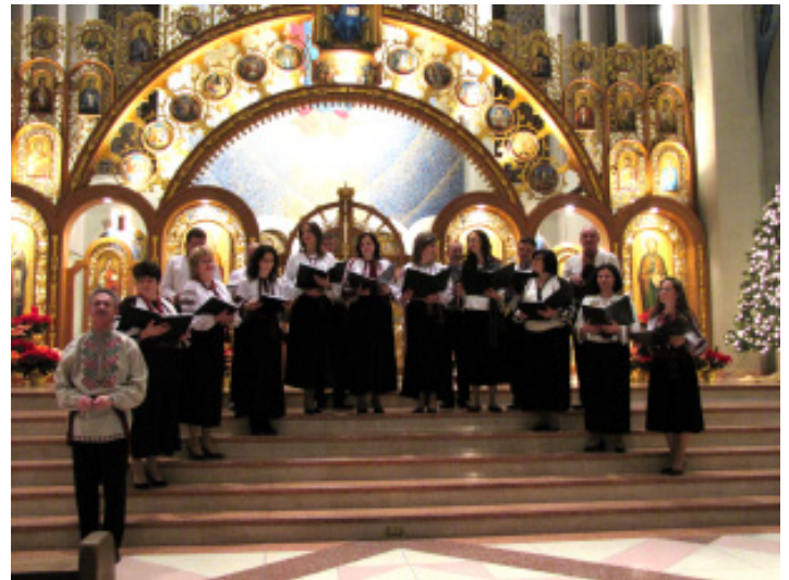
Chamber Choir "Accolade", Philadelphia, PA

Watch videos from the Festival on our Blog at www.thewayukrainian.blogspot.com