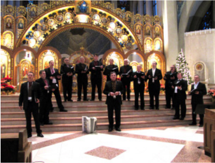
Male Choir "Dzvin", Philadelphia, PA