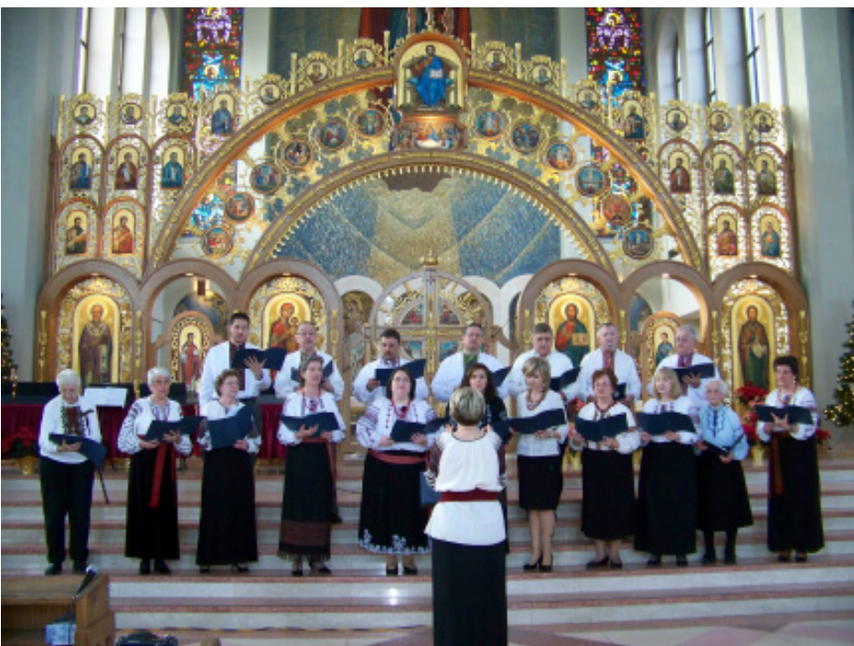
Combined choir from Cathedral of the Immaculate Conception, Philadelphia, PA and Annunciation of the Blessed Virgin Mary parish, Melrose Park, PA