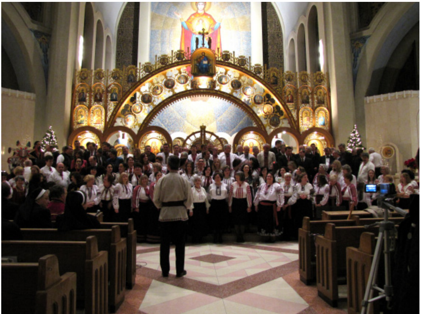
Combined Choir Finale

Watch videos from the Festival on our Blog at www.thewayukrainian.blogspot.com