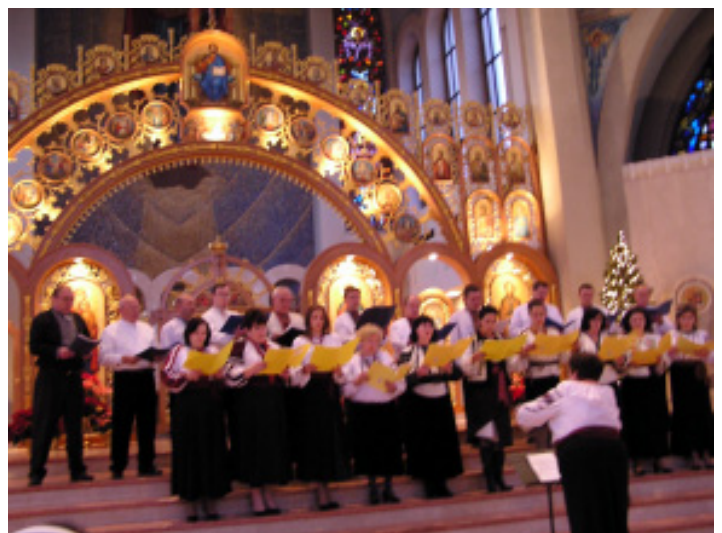
Choir from St. Michael parish, Jenkintown, PA