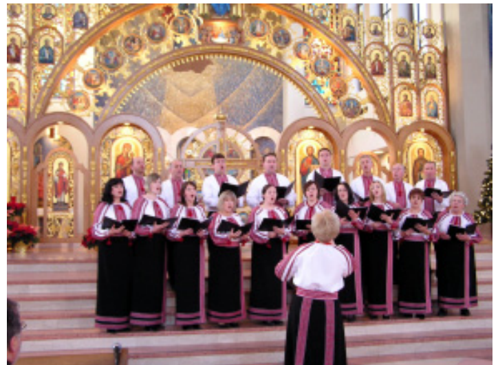
Choir from the Assumption of the BVM parish, Perth Amboy, NJ