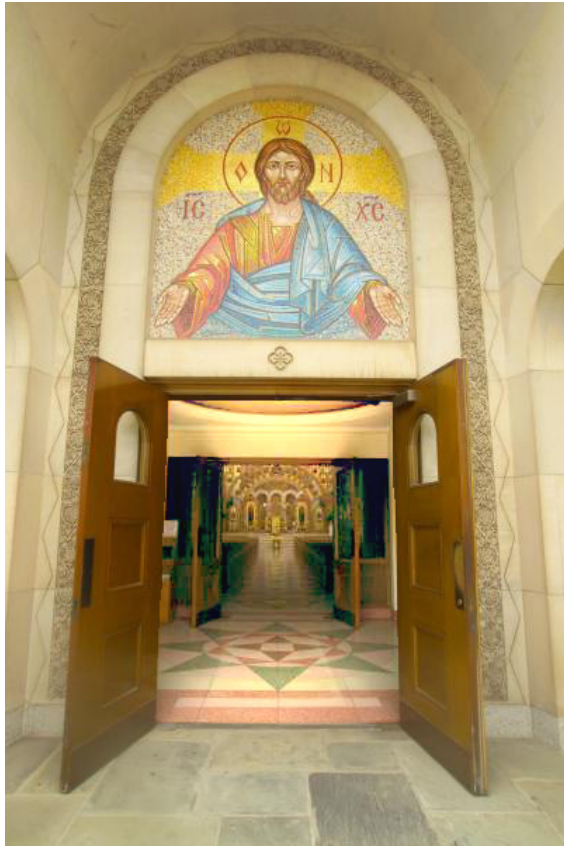
Front Entrance to the Ukrainian Catholic Cathedral of the Immaculate Conception, Philadelphia, PA