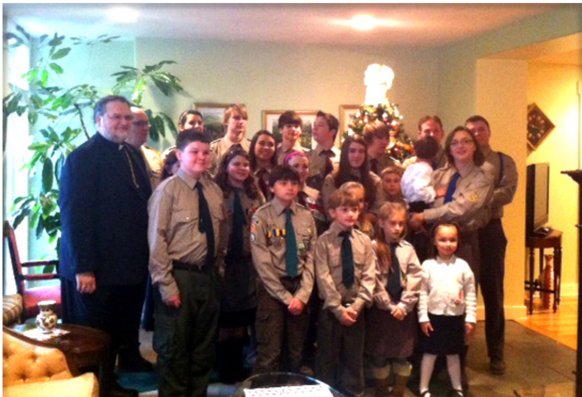
CYM Carolers (December 27, 2011)