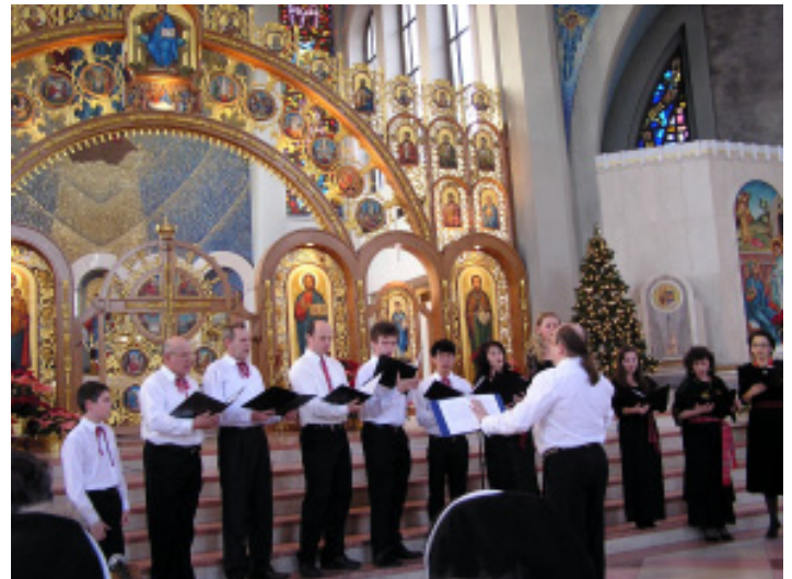
Leopolis Consort of The Ukrainian Music Institute of America (New York branch)