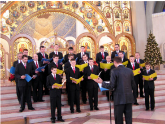
Male Choir of Ukrainian Baptist Church, Philadelphia, PA