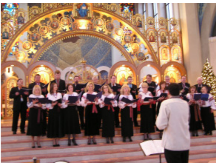
Choir from St. Michael parish, Baltimore, MD