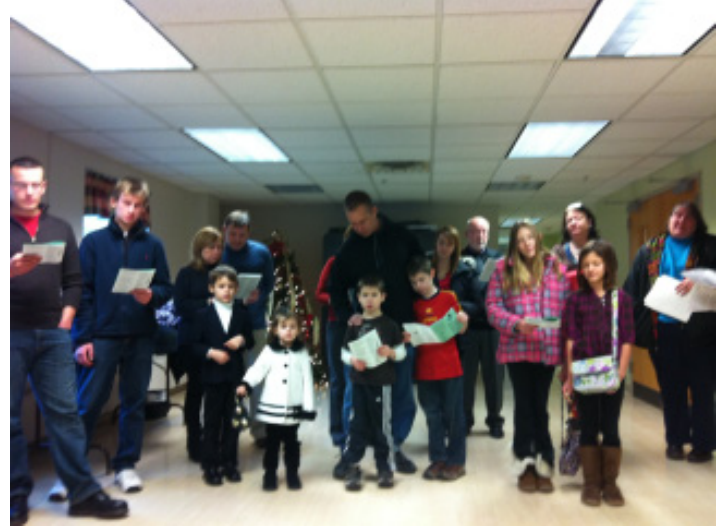
Hillside , NJ parish youth carol in Ukrainian and English to retired Roman Catholic Sisters of Mercy and clergy in Watchung , NJ .