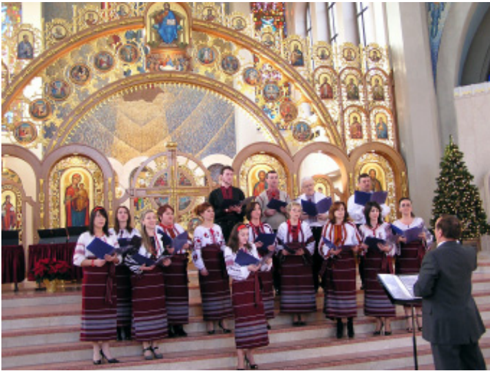
Choir from St. Josaphat parish, Trenton, NJ