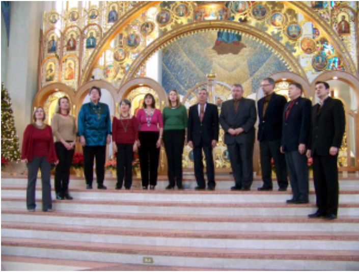
Choir "Living - SONG", Washington, DC