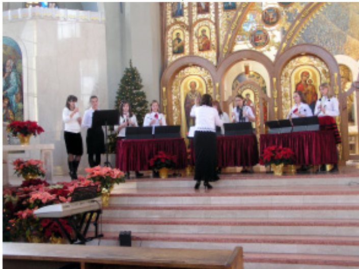
Children's Group "Kamertony" of Ukrainian Baptist Church, Philadelphia, PA