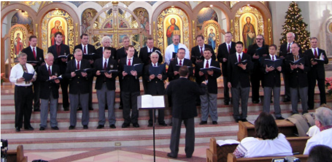
Male Choir "Prometheus", Philadelphia, PA