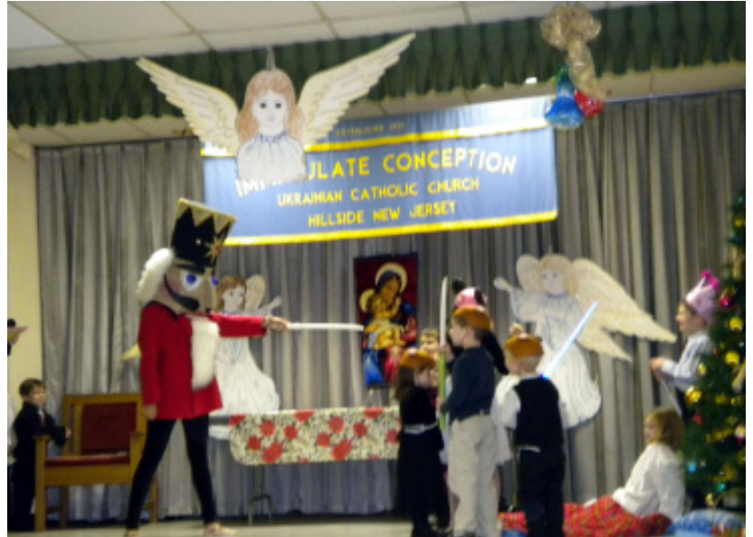
The parish children perform “The Nutcracker”.

See more pictures from St. Nicholas' visit on their parish website at: http://byzcath.org/ImmaculateConception/nicholas.htm