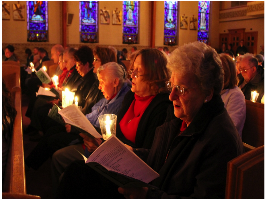
Near the conclusion of the Candlelight Christmas Pageant in St. Michael Ukrainian Catholic Church in Frackville, the audience held candles as the lights were dimmed and sang "Silent Night" and other carols.