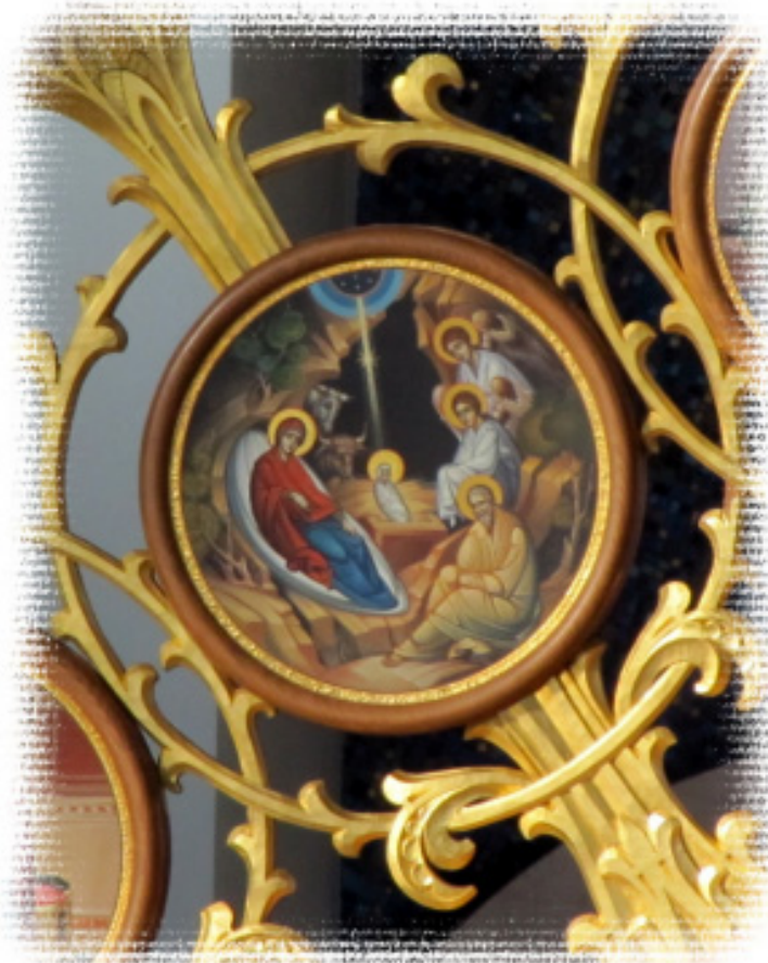
This photo is taken from the iconostas at the Cathedral.

Christmas is a very visible sign of God's love for us. The cave, the manger, the swaddling clothes - - all these are signs which underline that