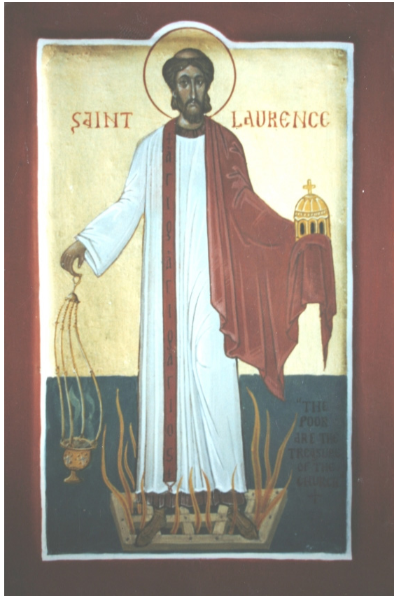
Icon of St. Lawrence, Archdeacon and Great-Martyr of Rome Iconographer unknown