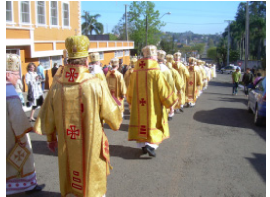
Procession of Bishops to the Hierarchical Divine Liturgy.