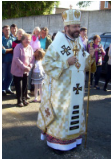
Patriarch Sviatoslav processes to the Hierarchical Divine Liturgy.