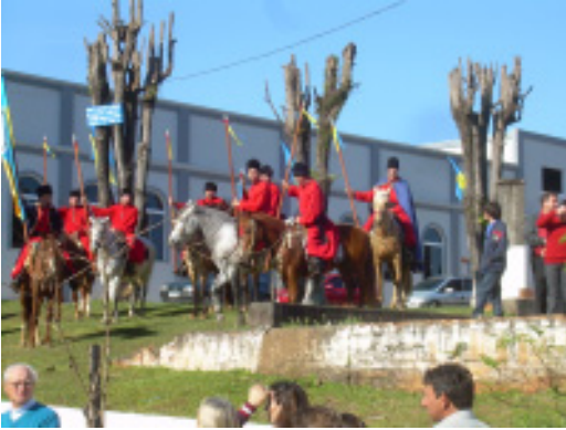
Ukrainian Cossacks riding hoses escort the procession of religious, priests, and bishops to the Hierarchical Divine Liturgy.