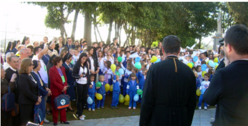
School children sing special songs of welcome for Patriarch Sviatoslav Shevchuk.