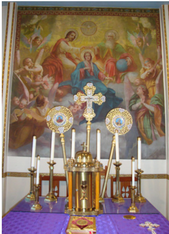
Front view of altar with an old Baroque style apsidal icon of the Crowning of Mary, Queen of Heaven St. Nicholas Ukrainian Catholic Church, Millville, NJ