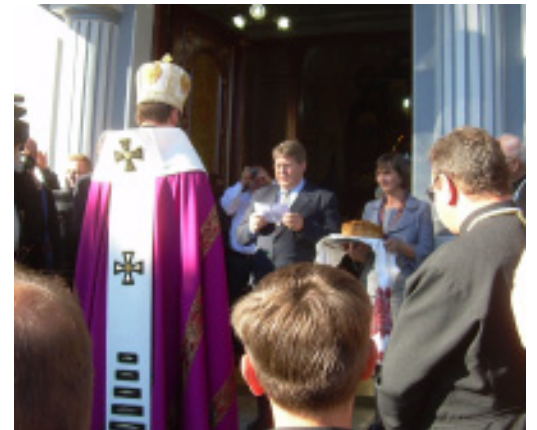
Patriarch Sviatoslav being greeted by faithful at entrance to St. Josaphat Ukrainian Catholic Church, Prudentopolis, Brazil.