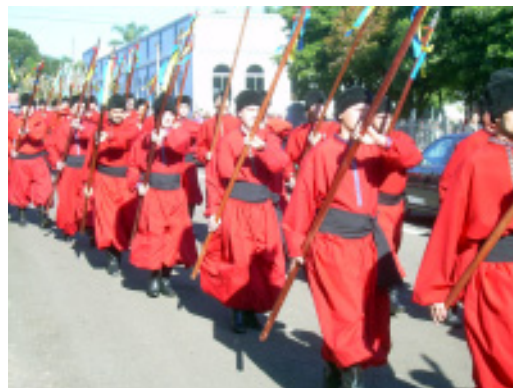
Ukrainian Cossacks marching in procession escorting participants of Sobor to the concluding Hierarchical Divine Liturgy for the Sobor.