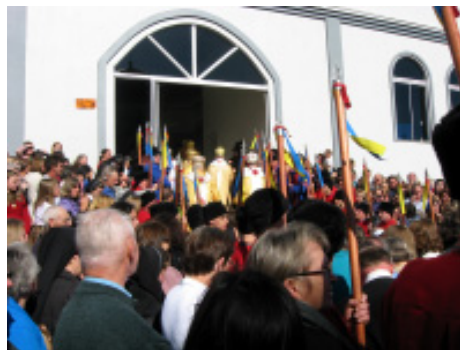
Hierarchical Divine Liturgy.