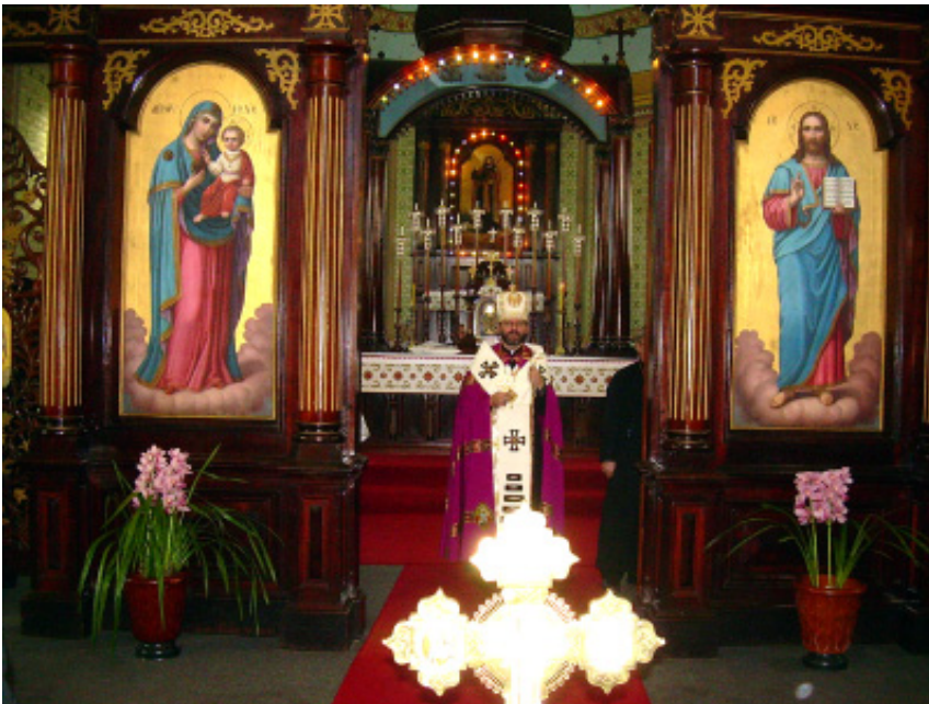
Patriarch Sviatoslav in St. Josaphat Ukrainian Catholic Church, Prudentopolis, Brazil.