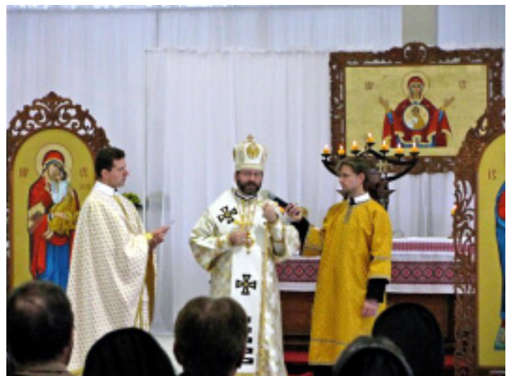
Hierarchical Divine Liturgy.