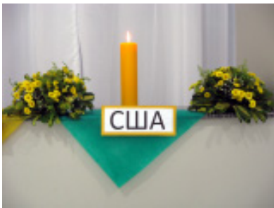
Candle representing the United States of America.