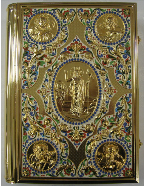
Gospel Book with Ormate Cover