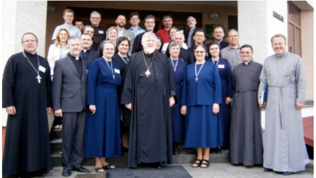
Directors of Religious Education for the Ukrainian Greek Catholic Church from around the world meet in Lviv, Ukraine

June 24 - 29, 2011 marked a historical milestone in the history of our Ukrainian Greek Catholic Church: the presentation of the new Catechism of the Ukrainian Greek Catholic Church, "Christ Our Pascha" after ten years of work. However, along side of the Catechism presentation, work on the development of an outline for the Catechumenate also took place.