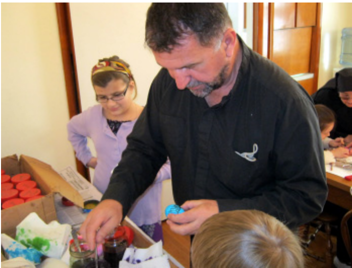
Dying the Pysanka different colors.