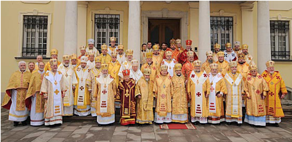
Group photo outside St. George's Cathedral.