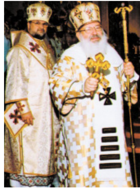
Photo: November 2002 at the Cathedral in Philadelphia

The hearts of all of the hierarchy, clergy, religious and faithful of the Ukrainian Catholic Metropolitan See of Philadelphia are grateful to our Major Archbishop Emeritus Lubomyr Cardinal Husar. He has guided our Church in difficult times with much God-given wisdom, foresight, courage and gentleness. His perseverance in the development of a vision for our Church will continue to exercise a significant positive influence on our Church for the decades ahead. Under his leadership, our Church has returned to its roots with the building of the Patriarchal Cathedral and Center in Kyiv. Lubomyr Cardinal Husar is valued by all Ukrainians for his wisdom and integrity, providing for needed moral leadership for all. We all anticipate that he will continue this valued and needed ministry as the Major Archbishop Emeritus living in Kyiv.