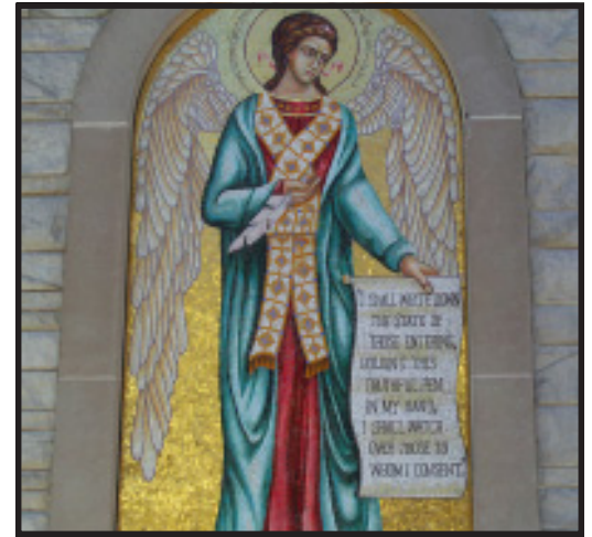
Mosaic in Shenandoah, PA

As Jesus walked along, he saw Levi son of Alphaeus sitting at the tax collector's booth. "Follow me," Jesus told him, and Levi got up and followed him. While Jesus was having dinner at Levi's house, many tax collectors and sinners were eating with him and his disciples, for there were many who followed him. When the teachers of the law who were Pharisees saw him eating with the sinners and tax collectors, they asked his disciples: "Why does he eat with tax collectors and sinners?" On hearing this, Jesus said to them, "It is not the healthy who need a doctor, but the sick. I have not come to call the righteous, but sinners." (Mk. 2, 14-17)