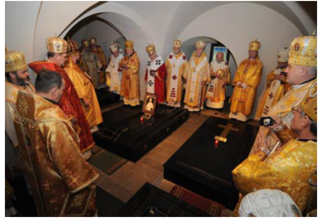
The bishops prayed in the crypt of St. George's Cathedral, where the remains of three UGCC leaders in the past century are lying: Metropolitan Andriy (Sheptytsky), Patriarch Josyp Slipyj and Patriarch Myroslav Ivan (Lubachivsky).