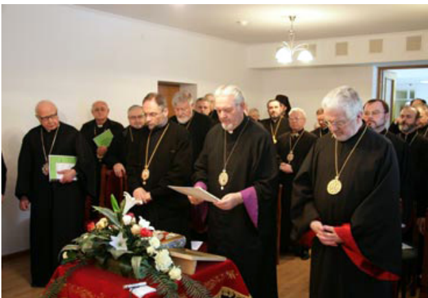
Bishop-emeritus Basil Losten, who is the oldest by Episcopal Ordination, read the oath on behalf of all the members of the Synod.