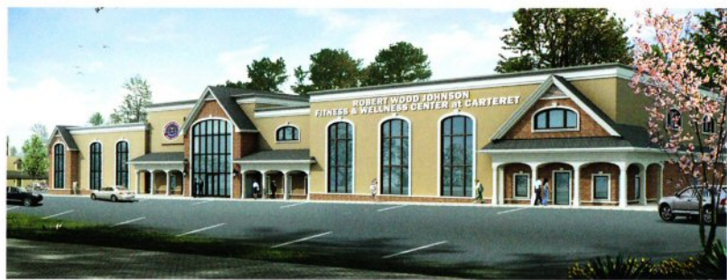
THE AREA'S MOST COMPREHENSIVE FITNESS & WELLNESS CENTER IS UNDER CONSTRUCTION IN CARTERET